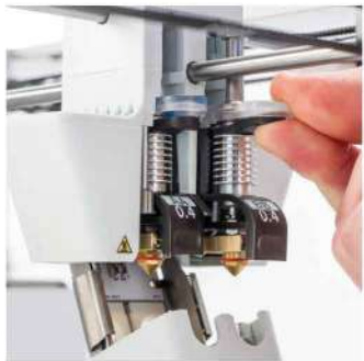
Print core AA 0.25, 0.4, 0.8 mm Quick-swap nozzles minimize downtime