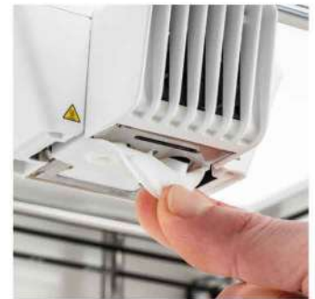
Nozzle covers x10 Replacement covers keep your print head in top condition