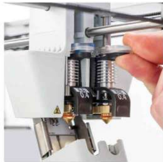
Print core BB 0.4, 0.8 mm Specially designed for printing soluble support material