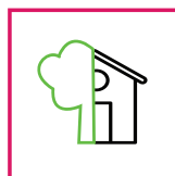
Outdoor / Indoor